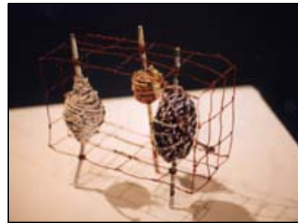
Todd Israel - Balls of Text