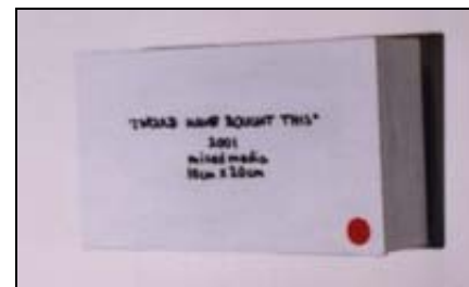
Gisela Zuchner-Mogall - Just Pretending